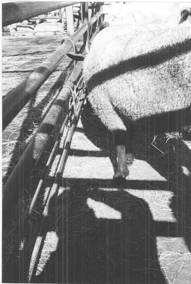
Photo showing newly constructed hang on panel to keep lambs from escaping under bottom rails of auction yard pens.

Nancy Peterson, Chairperson Peace Country Sheep Sale